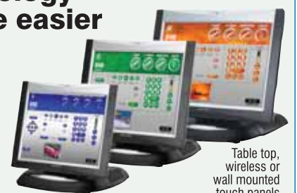
Table top, wireless or wall mounted touch panels

Electro Sound AUDIO VIDEO INFORMATION TECHNOLOGY